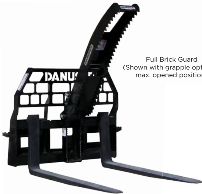
Full Brick Guard (Shown with grapple option in max. opened position)